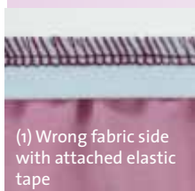
(1) Wrong fabric side with attached elastic tape