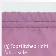
(3) Topstitched right fabric side