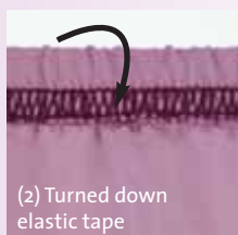
(2) Turned down elastic tape